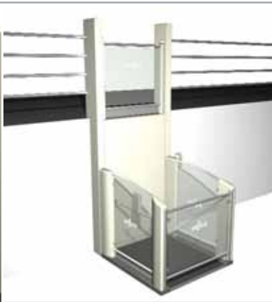
Travel up to 2 metres