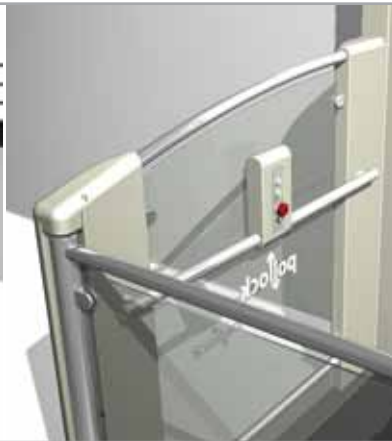
Easy to use controls