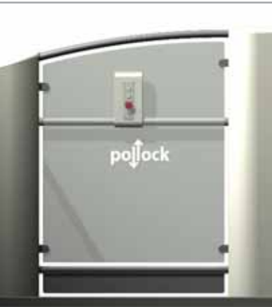
Elegantly curved side panels